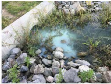
Paint improperly disposed of into a drain investigation