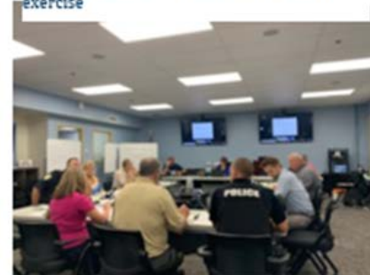
Exercising local school districts plans