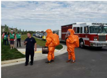
On scene at the LEPC full scale exercise

Throughout 2021, the DCOHSEM team has been fortunate to work closely with many of our partner agencies. Somedays are filled with grant work, planning, outreach, exercises, and deploying equipment, while other days are response days. This may include hazardous materials or severe weather response. The DCOHSEM team is trained in hazardous materials response and severe weather response. Please enjoy some photos from the past year.