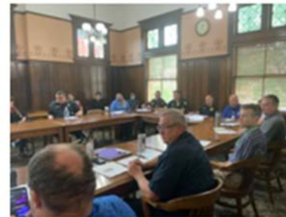
DCOHSEM hosted the Ironman planning meeting