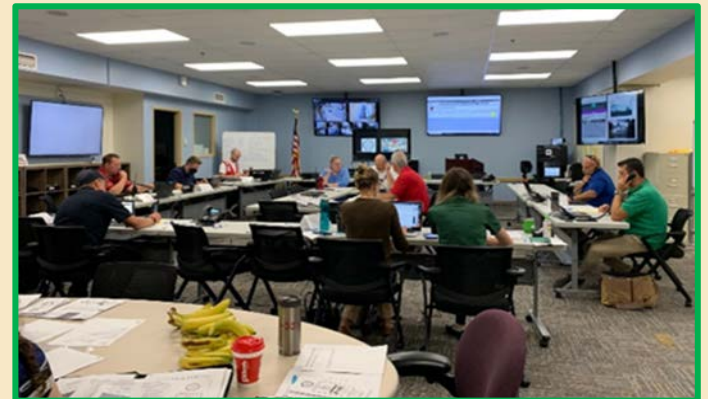
EOC players working through exercise scenario

After numerous months of planning and collaboration, the 2021 Delaware County LEPC hazardous materials full-scale exercise (FSE) came to fruition in Orange Township. DCOHSEM coordinated these efforts and eight separate objectives were evaluated by emergency management professionals from other counties and the State of Ohio. The exercise involved simulated field response to a transportation incident scenario with support coming from the Delaware County Emergency Operations Center. While there were numerous “lessons learned”, the exercise was deemed a success and was only possible due to tremendous support from numerous partner agencies and organizations.