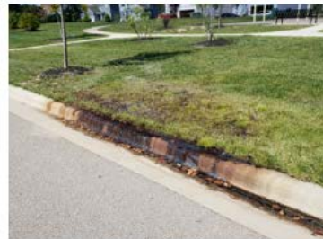
Investigation of reported spill - natural occurrence of iron bacteria.