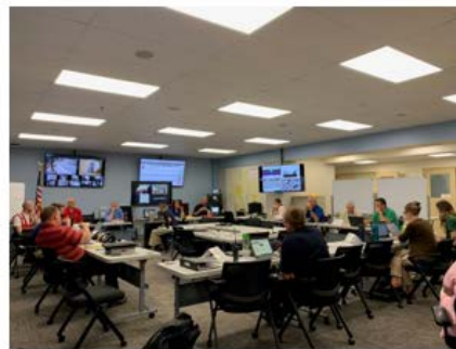
In the EOC for the Delaware County LEPC full scale exercise