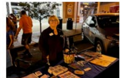
DCOHSEM staff participating in fire department outreach