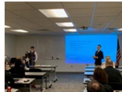
DCOHSEM facilitated the Delaware County Child Abduction Response Team (CART) exercise