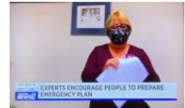
Media interviews discussing preparedness