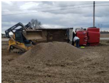
Diesel fuel spill