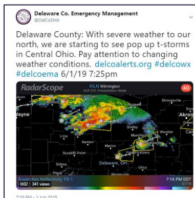
Social media weather updates